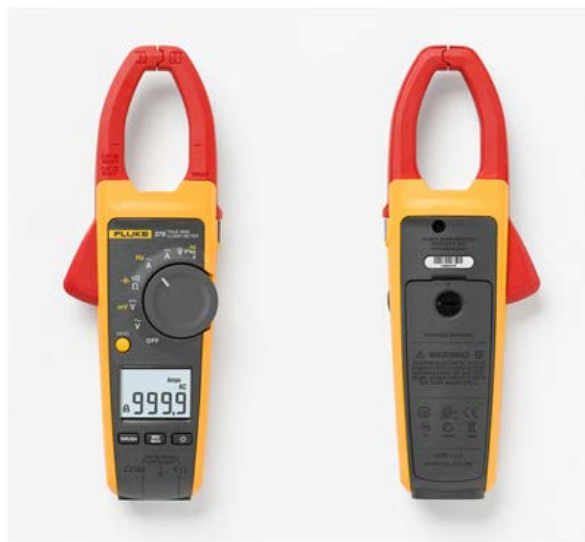
Figure 1 - 373, 374, 375 and 376 Digital Clamp Meters

Hazard: Exposure to electrical shock, arc flash and/or electrocution depending upon the equipment and voltage involved. The voltage displayed by each of these devices may be less than the voltage in the item being evaluated. In some cases, zero volts will be displayed when a voltage is present.