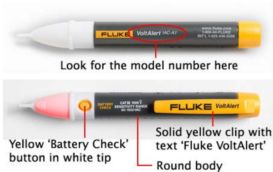
Figure 5 – 1AC-I VoltAlert Voltage Tester