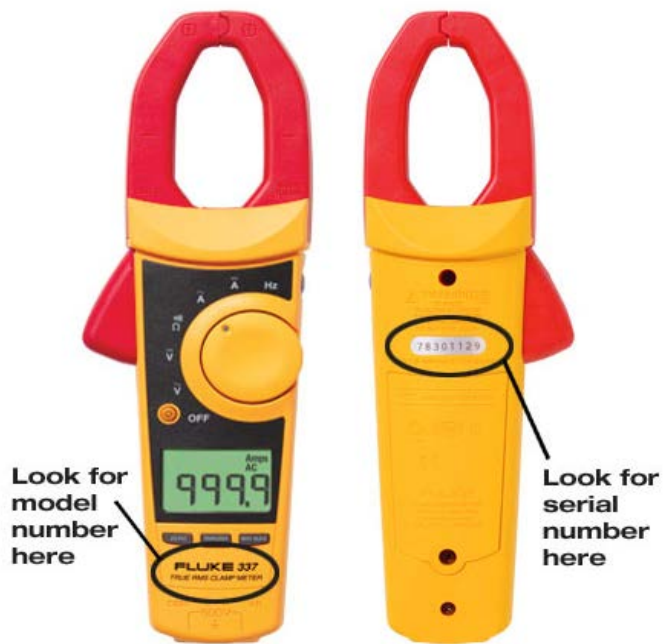
Figure 4 - 333, 334, 335, 336 and 337 Digital Clamp Meters

LL-2013-LLNL-04, March 5, 2013, LLNL-POST-624069