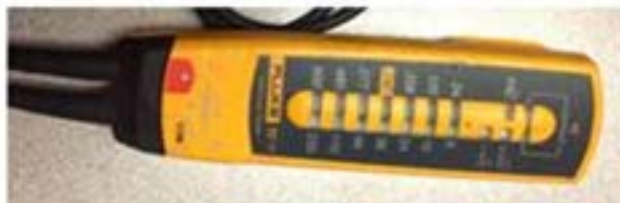
Figure 3 - Fluke T2 Electrical Tester